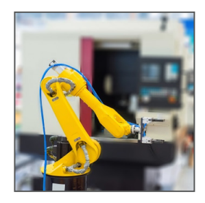
Industrial Motor Applications