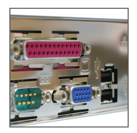
Power and Signal