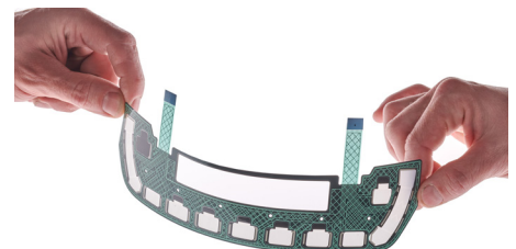
Flexible PEDOT Circuitry